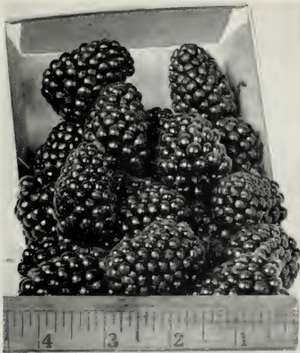
It's Easy to Grow Giant Boysenberries Like These